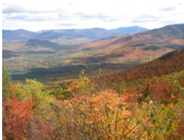
{View from the top of a mountain, Lake Placid, Adirondacks}

http://gonewengland.about.com/od/fallfoliage/ht/htpeakfoliage.htm